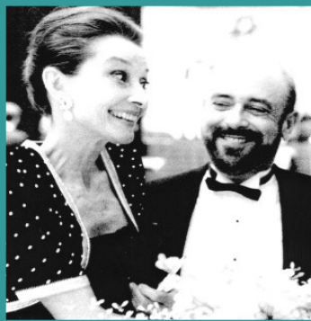
BW & Audrey Hepburn